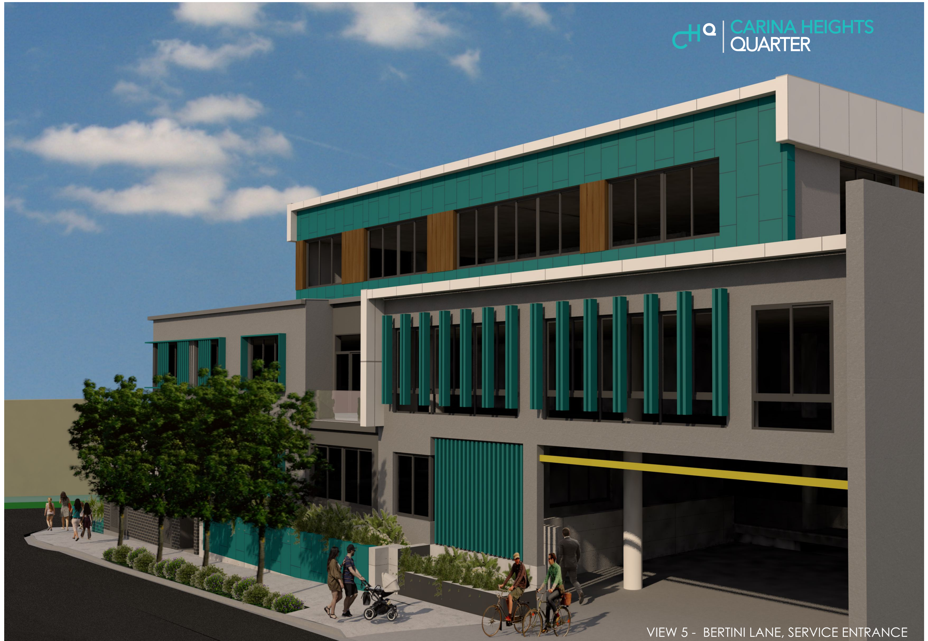
VIEW 5 - BERTINI LANE, SERVICE ENTRANCE