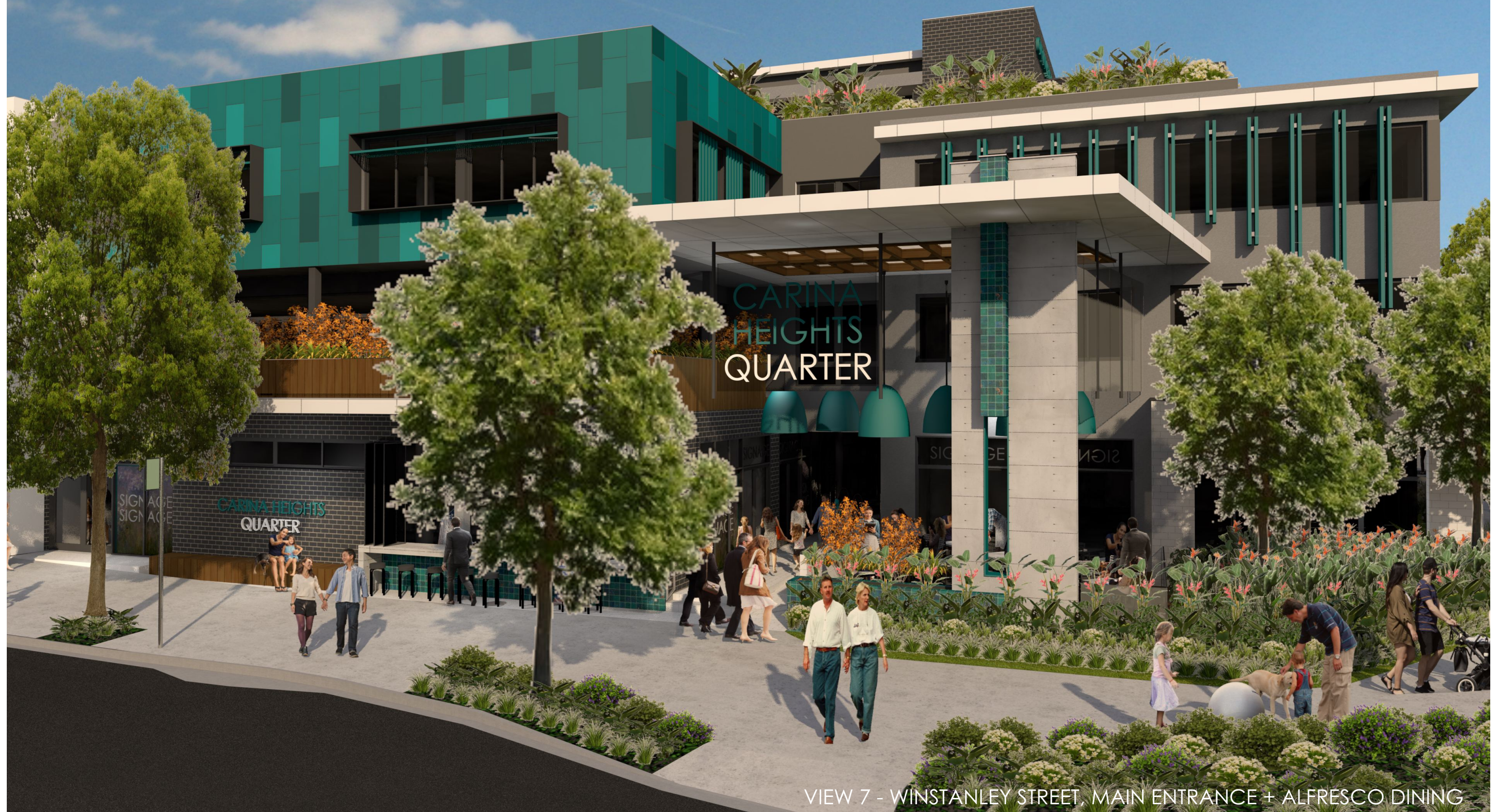
VIEW 7 - WINSTANLEY STREET, MAIN ENTRANCE + ALFRESCO DINING