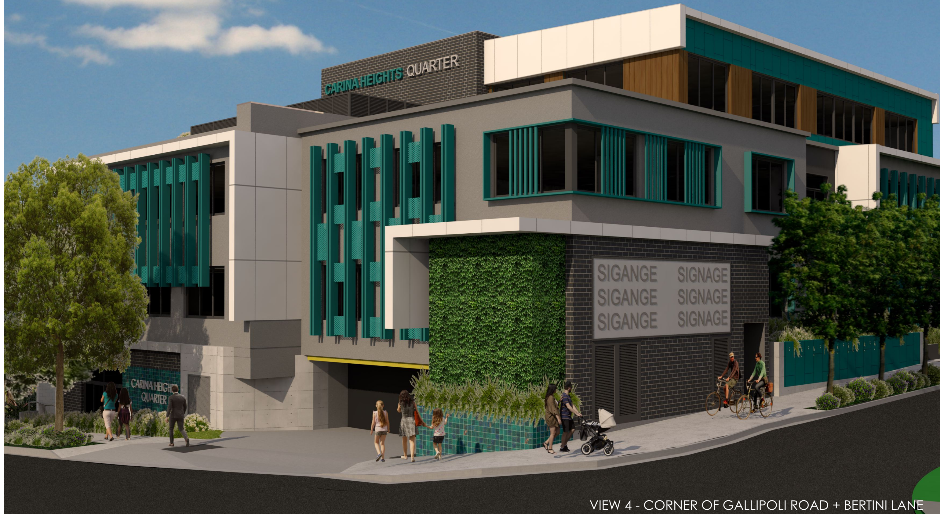
VIEW 4 - CORNER OF GALLIPOLI ROAD + BERTINI LANE