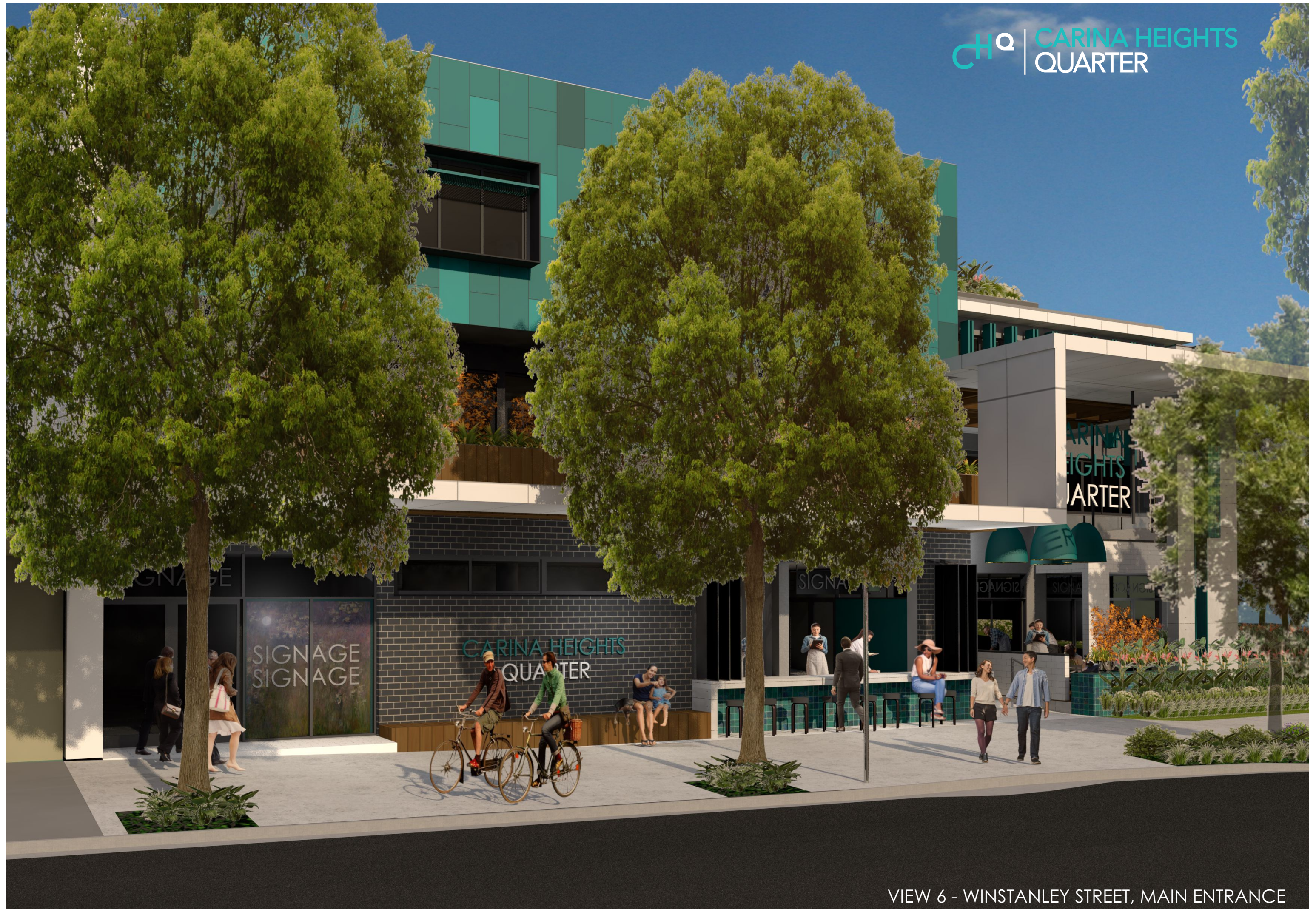
VIEW 6 - WINSTANLEY STREET, MAIN ENTRANCE