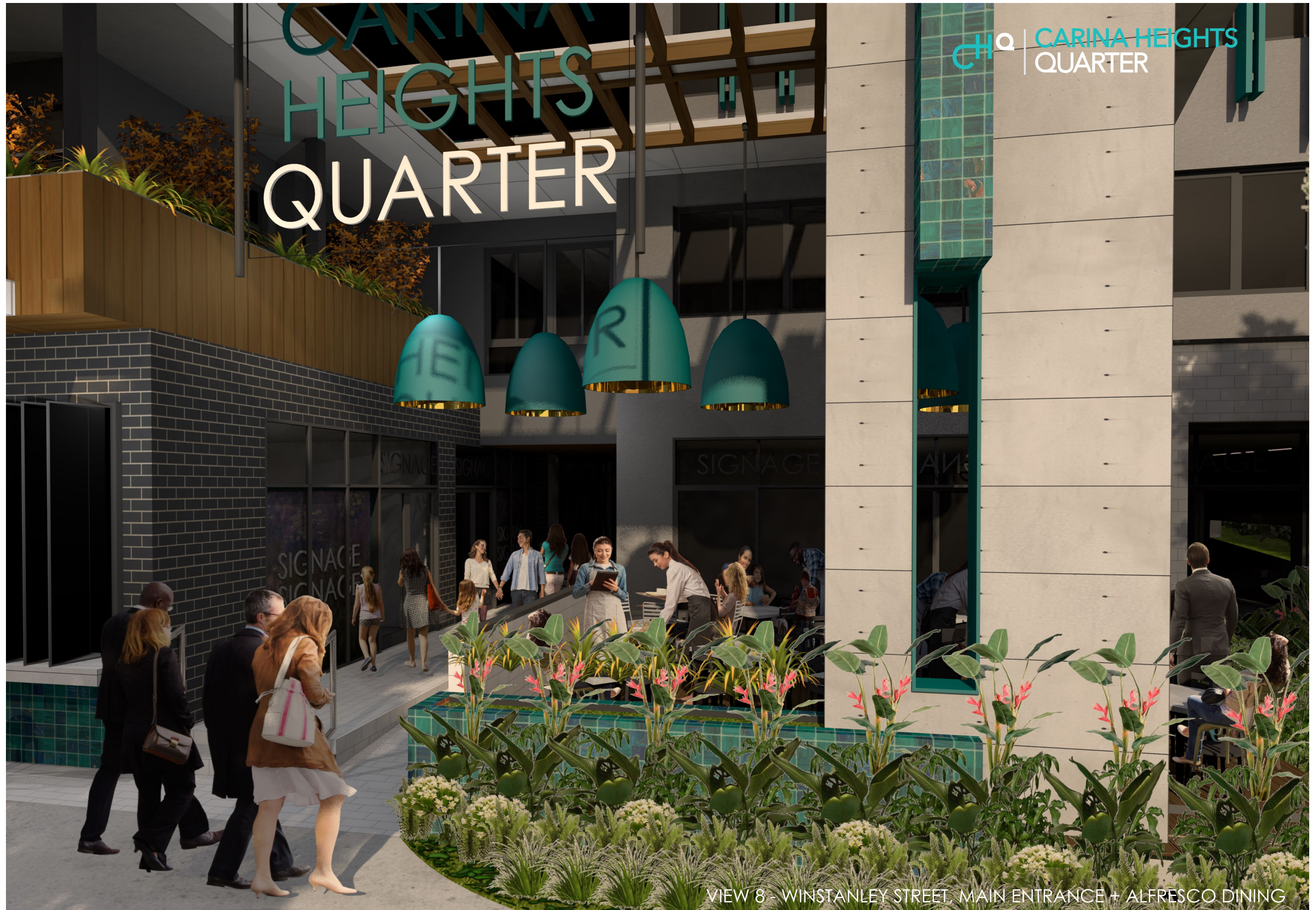
VIEW 8 - WINSTANLEY STREET, MAIN ENTRANCE + ALFRESCO DINING