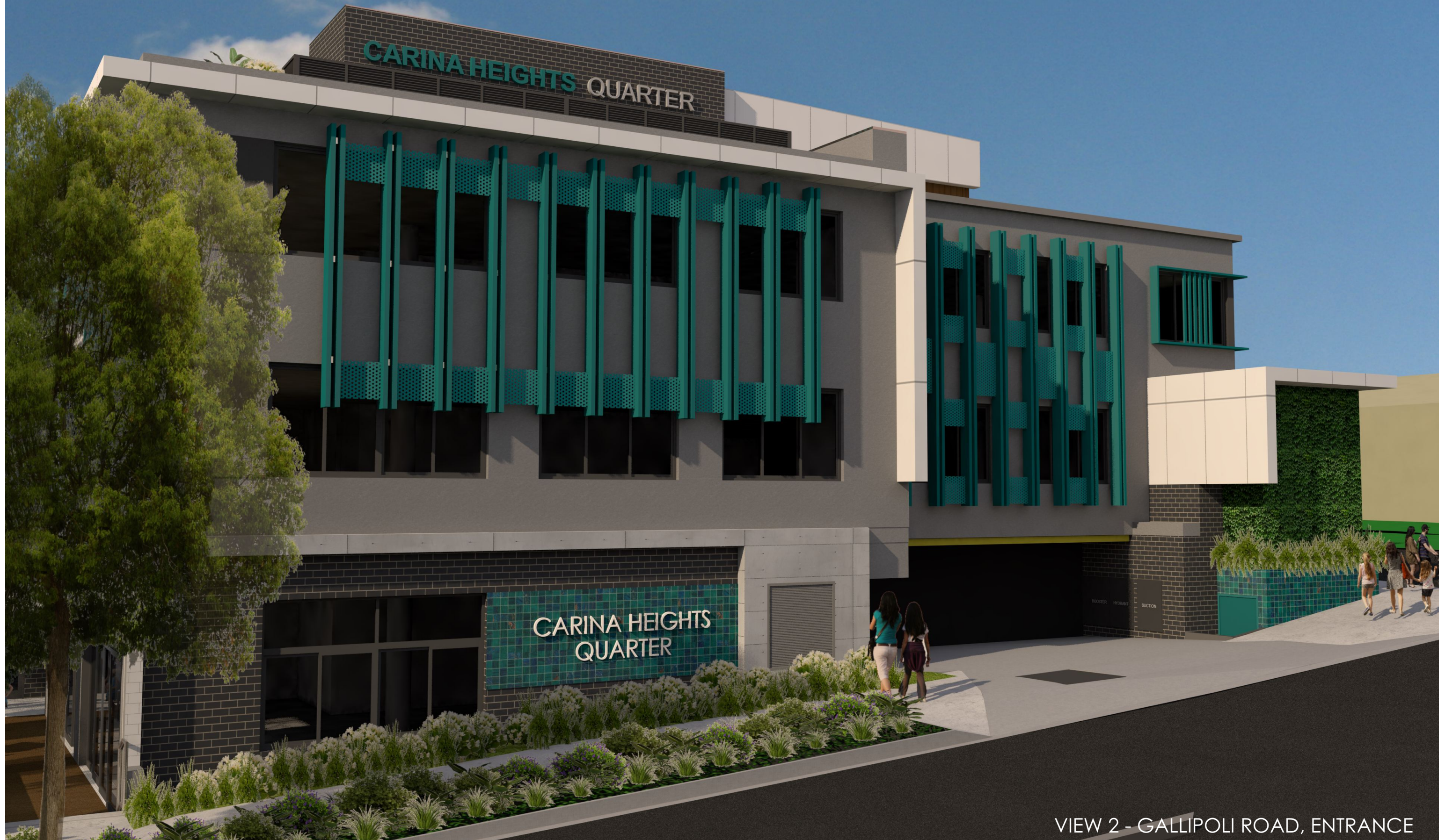
VIEW 2 - GALLIPOLI ROAD, ENTRANCE