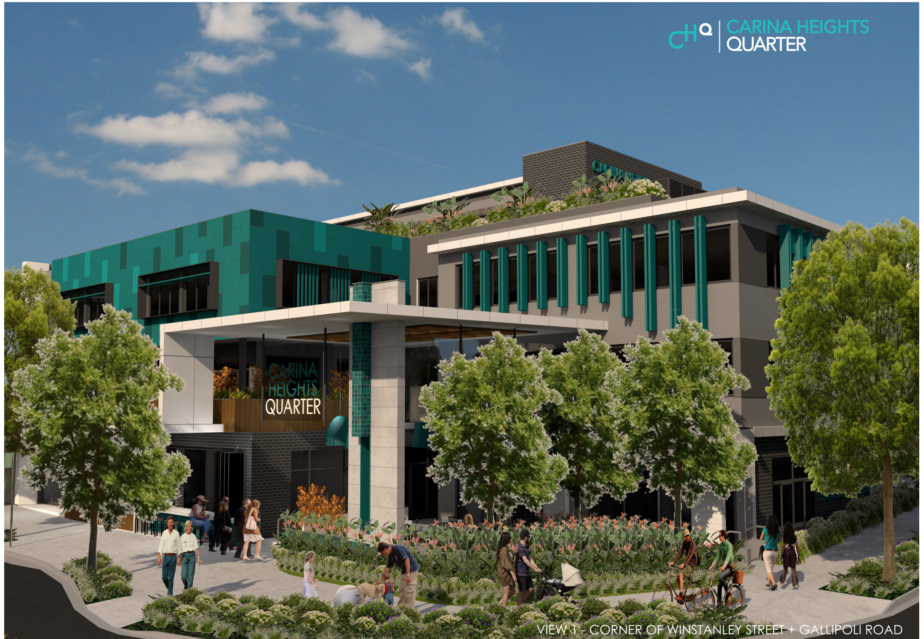
VIEW 1 - CORNER OF WINSTANLEY STREET + GALLIPOLI ROAD